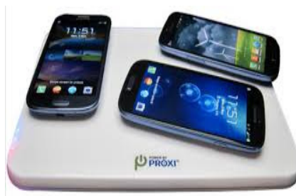
Fig. 3. Wireless pad for charging smart phones.

Wireless charging of smart phones and tablets involve the use of a charging pad which acts as the transmitter, transferring power to a miniaturized A wireless receiver integrated into the Smartphone Miniaturized receivers are integrated directly into the device, removing the need for external housing covers or sleeves on devices.